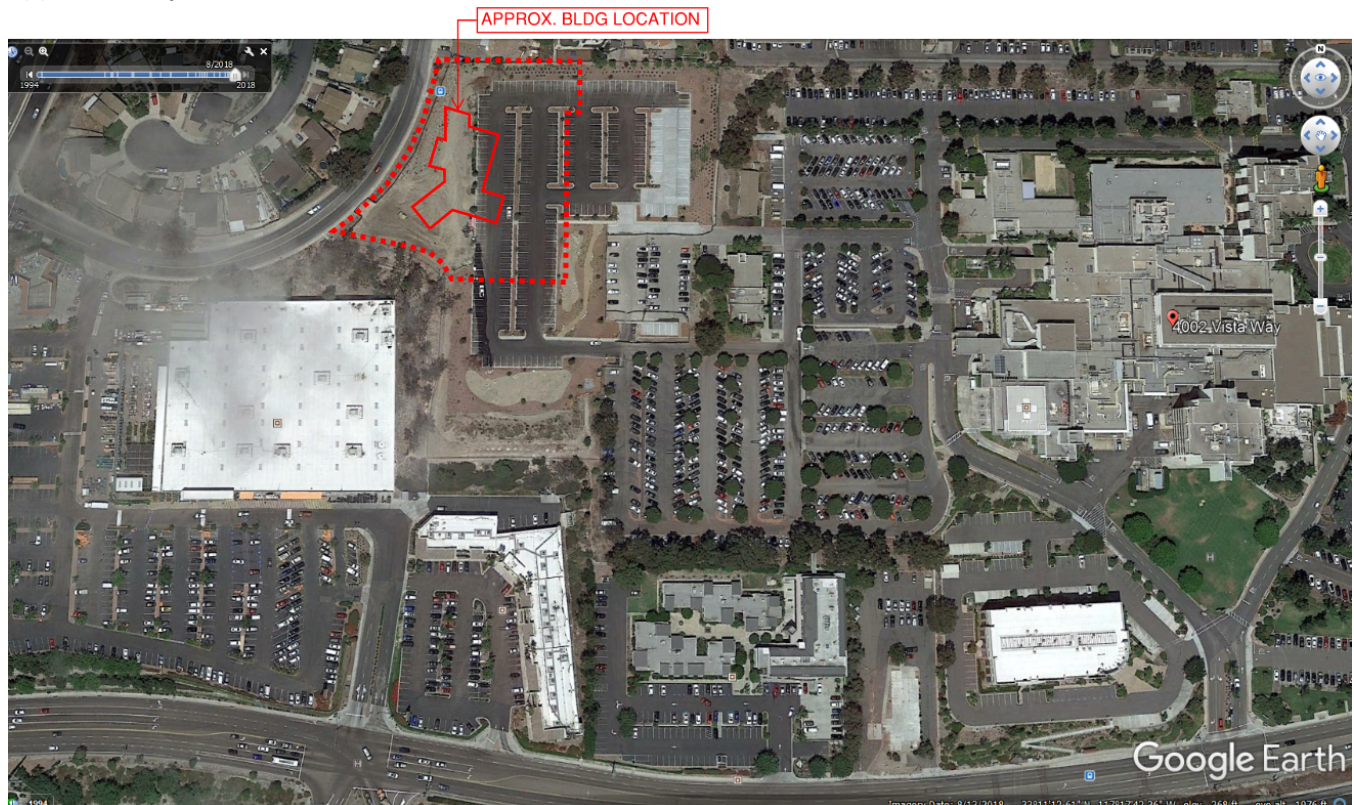
Figure 1-1

The proposed project is located within the city of Oceanside, California, in northern San Diego County. The area of work is located on the northwest unoccupied portion of the Tri-City Medical Campus and part of the existing parking lot (Figure 1-1). The main hospital is located to the east. Public access to the new facility is provided through the parking lots, entered by the south entrance via Vista Way. A new driveway will be created off Waring Road, and shall be only for Fire Department access only (vehicular access & man gates are also locked). One and two story single-family residential neighborhoods are located at grade and adjacent to the north and across Waring to the west. To the south is a large one-story "big box" retail store sitting at much lower grade down the hillside. There's also access to public transportation and a freeway. The proposed building area is approximately 13,560 building gross square feet and is on a site of approximately 0.5 acres.