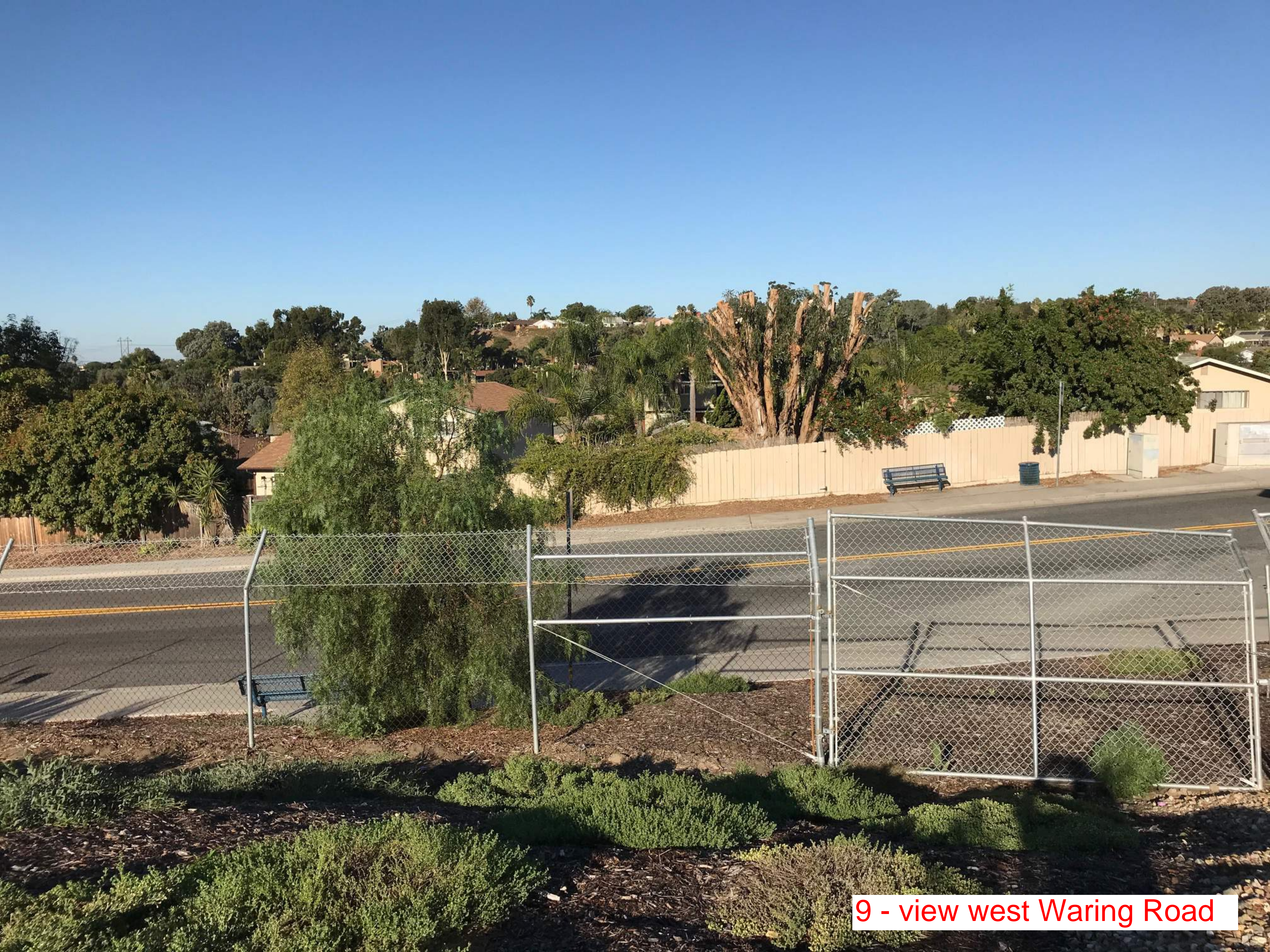
9 - view west Waring Road