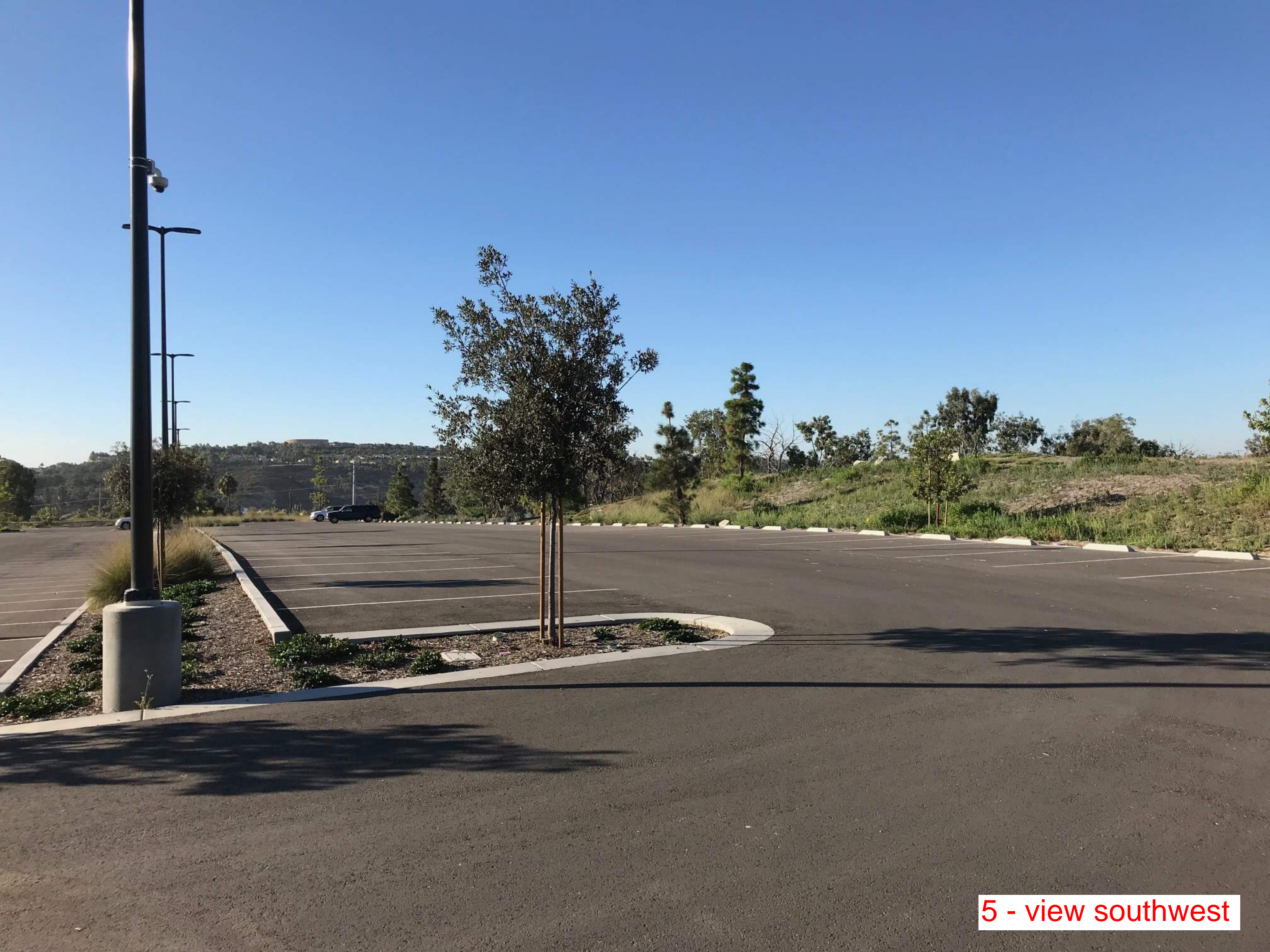
5 - view southwest