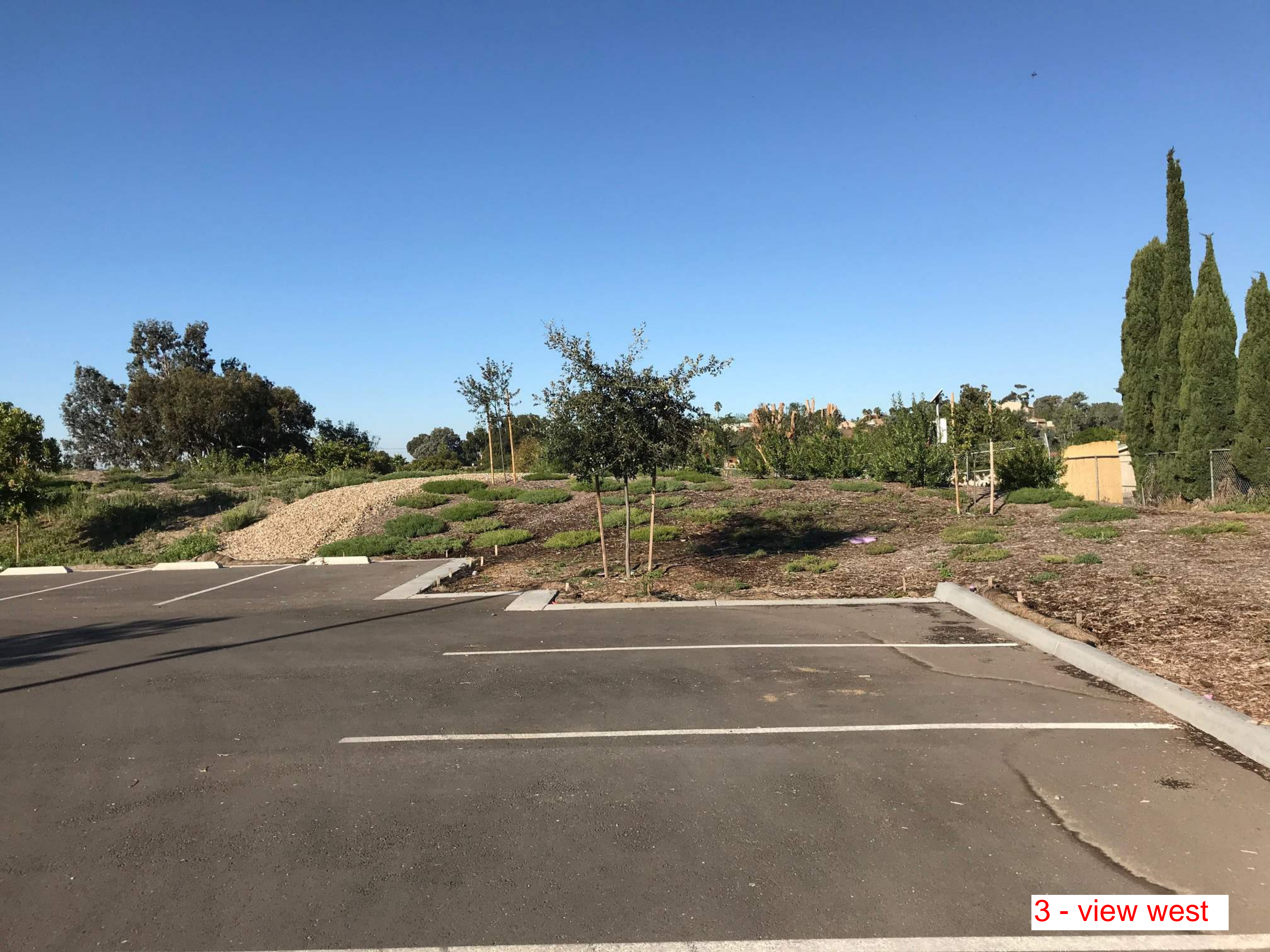
3 - view west