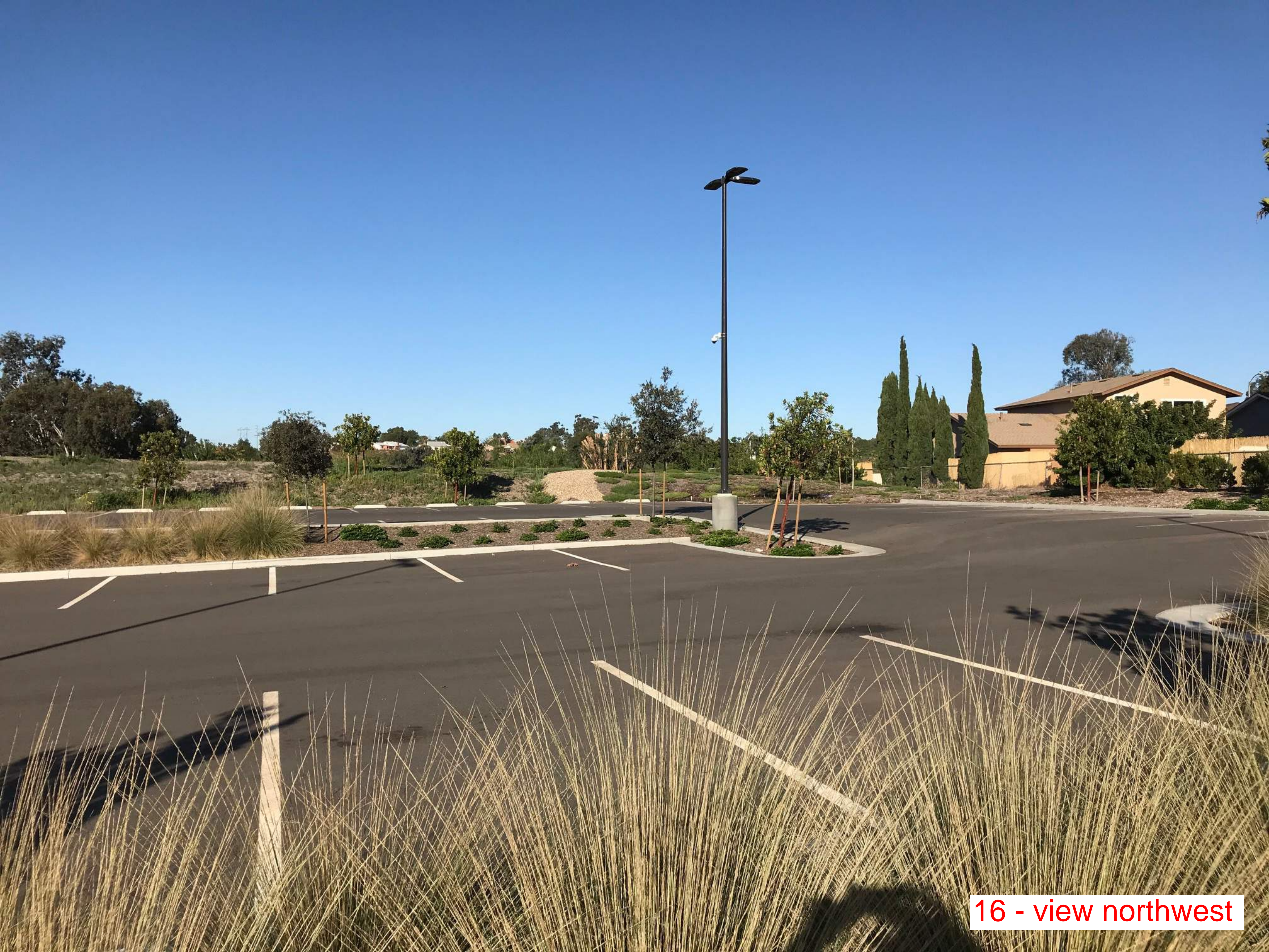
16 - view northwest