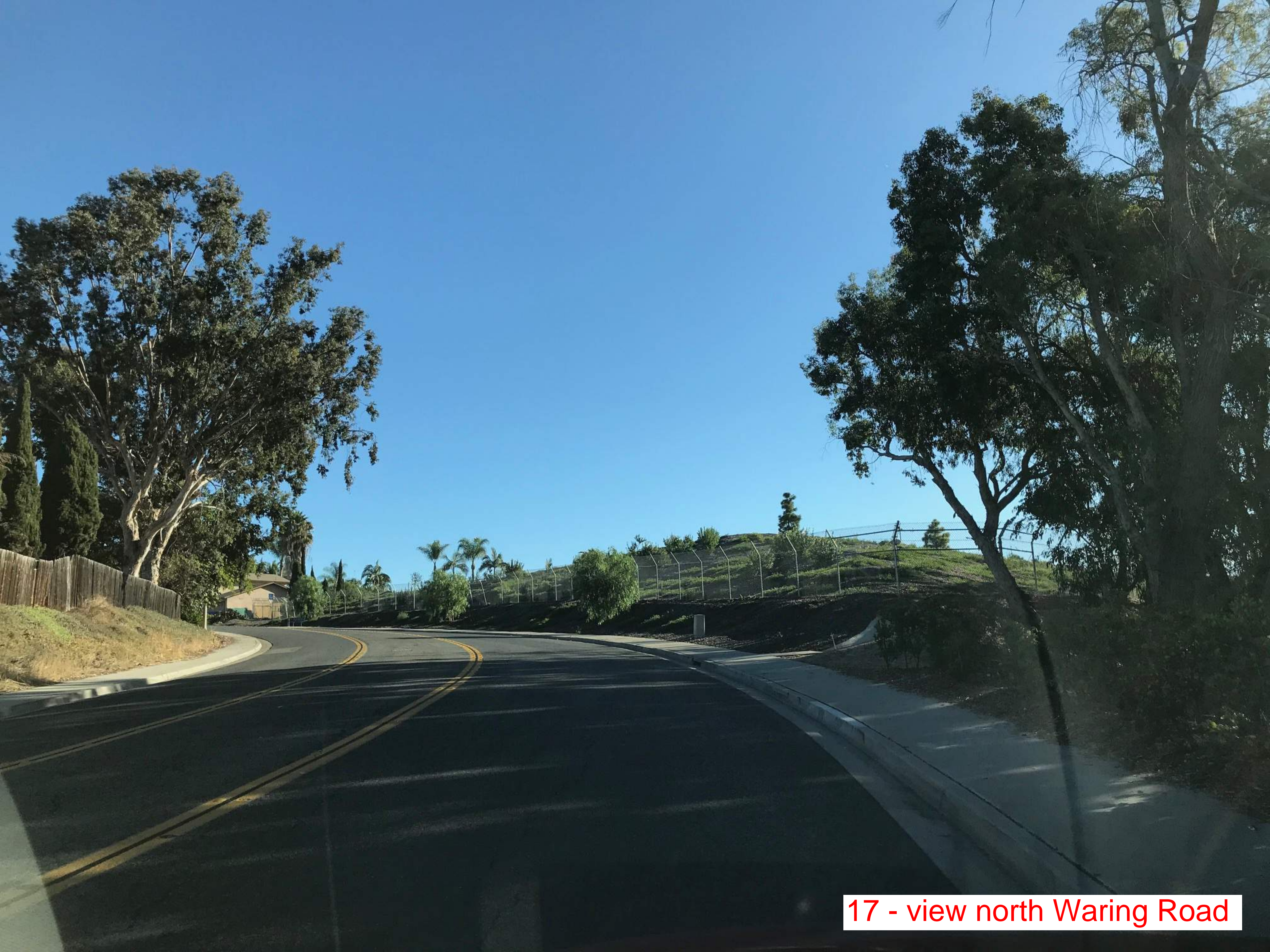
17 - view north Waring Road