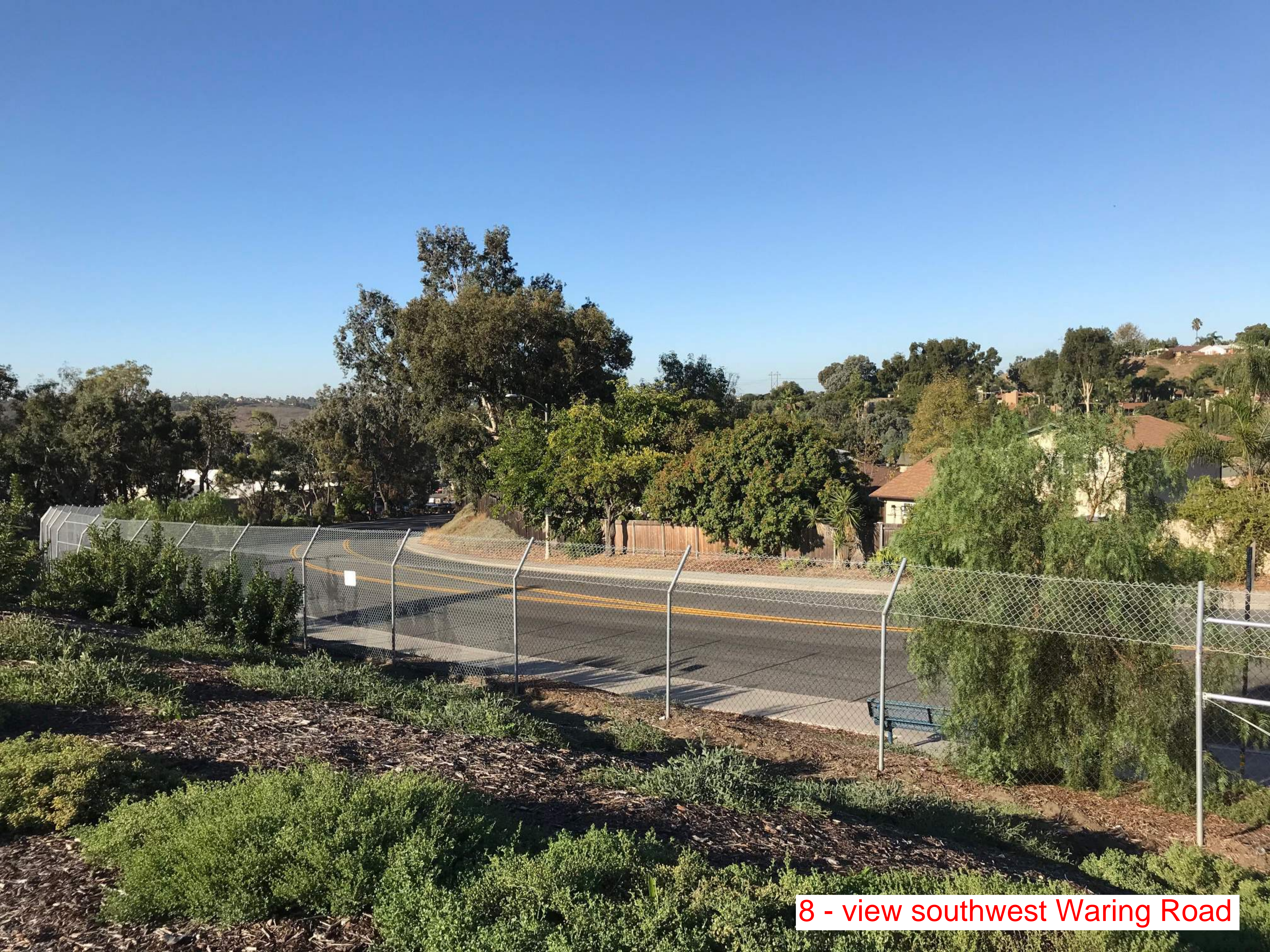
8 - view southwest Waring Road