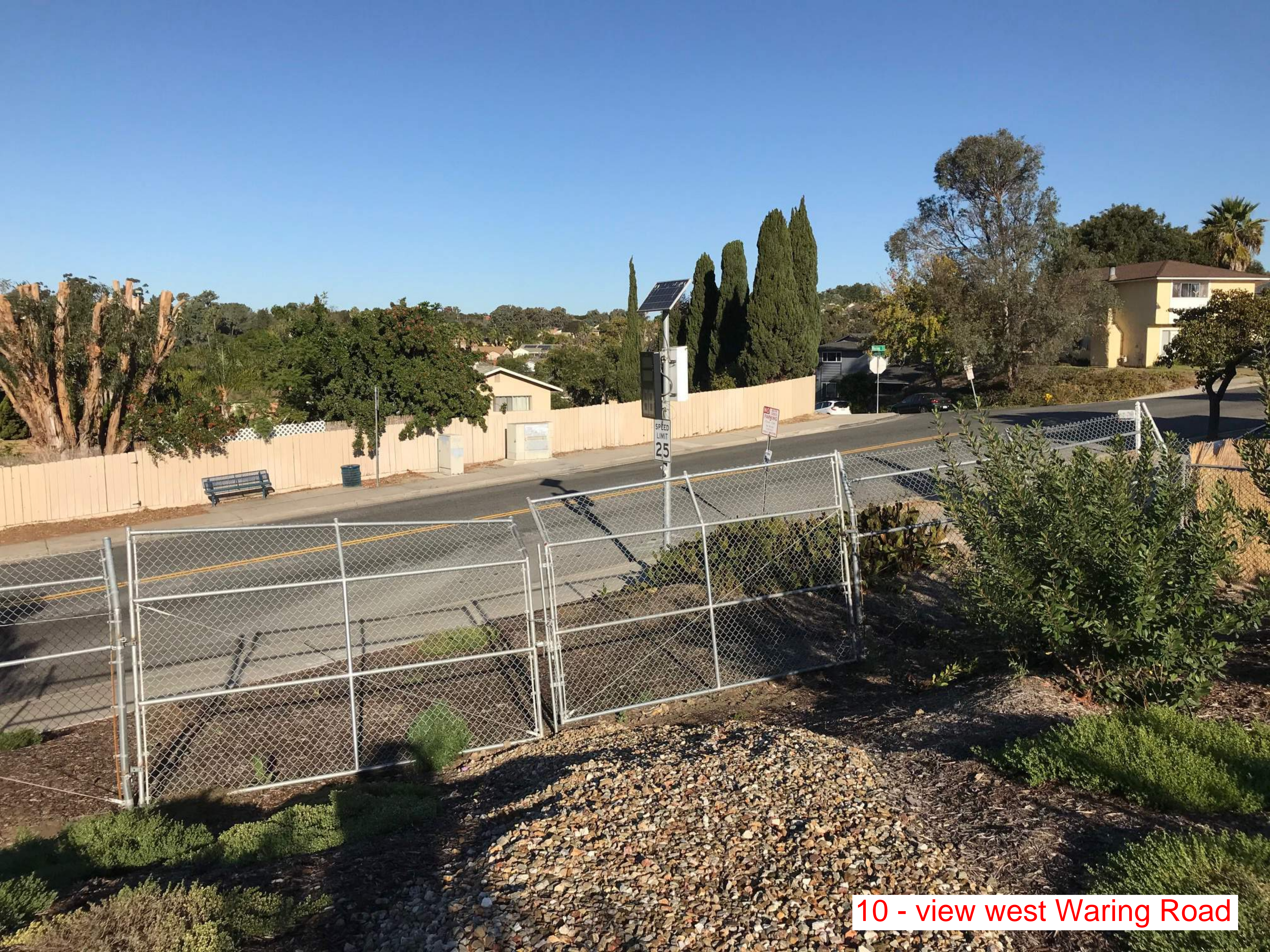
10 - view west Waring Road