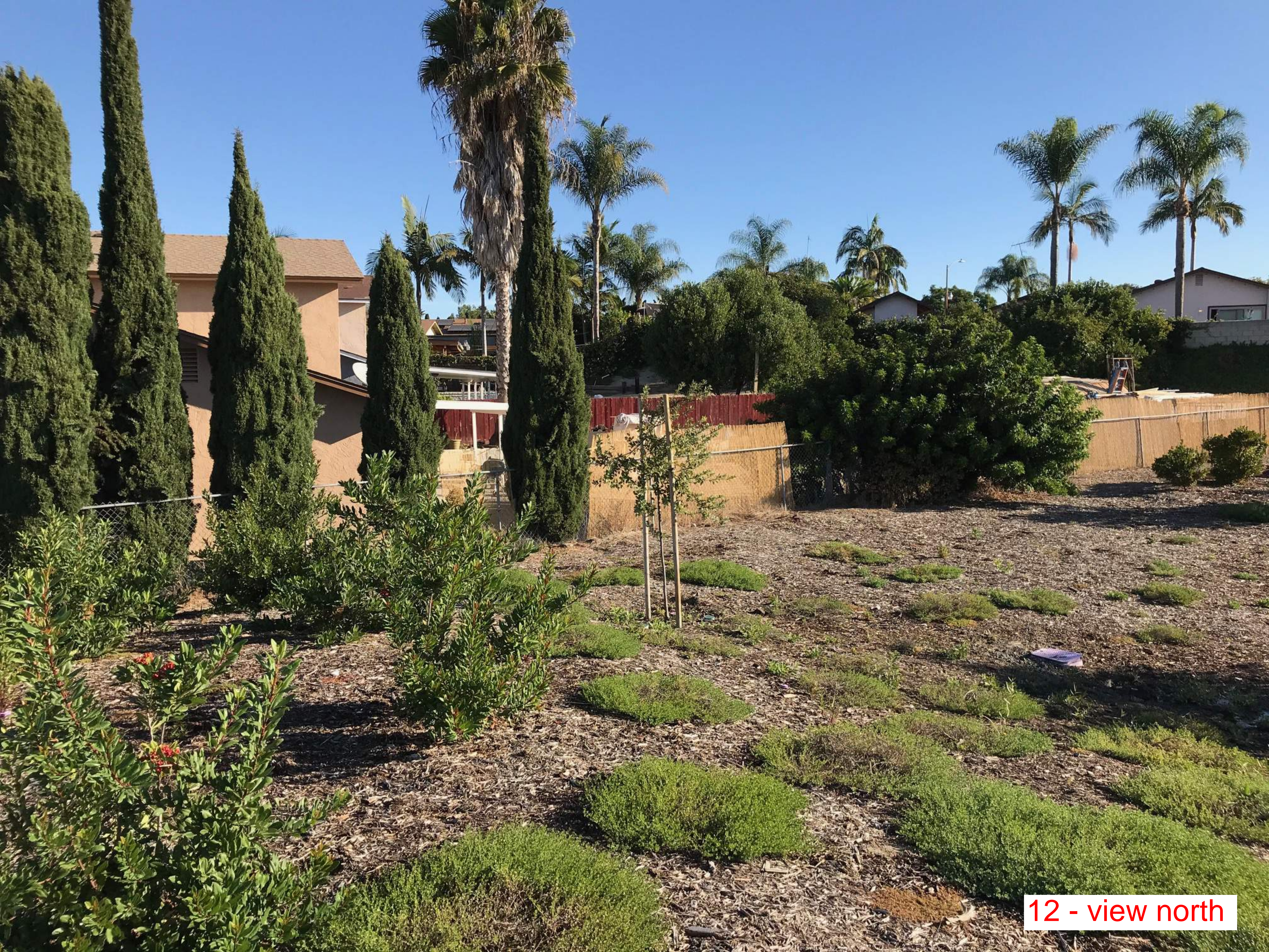
12 - view north