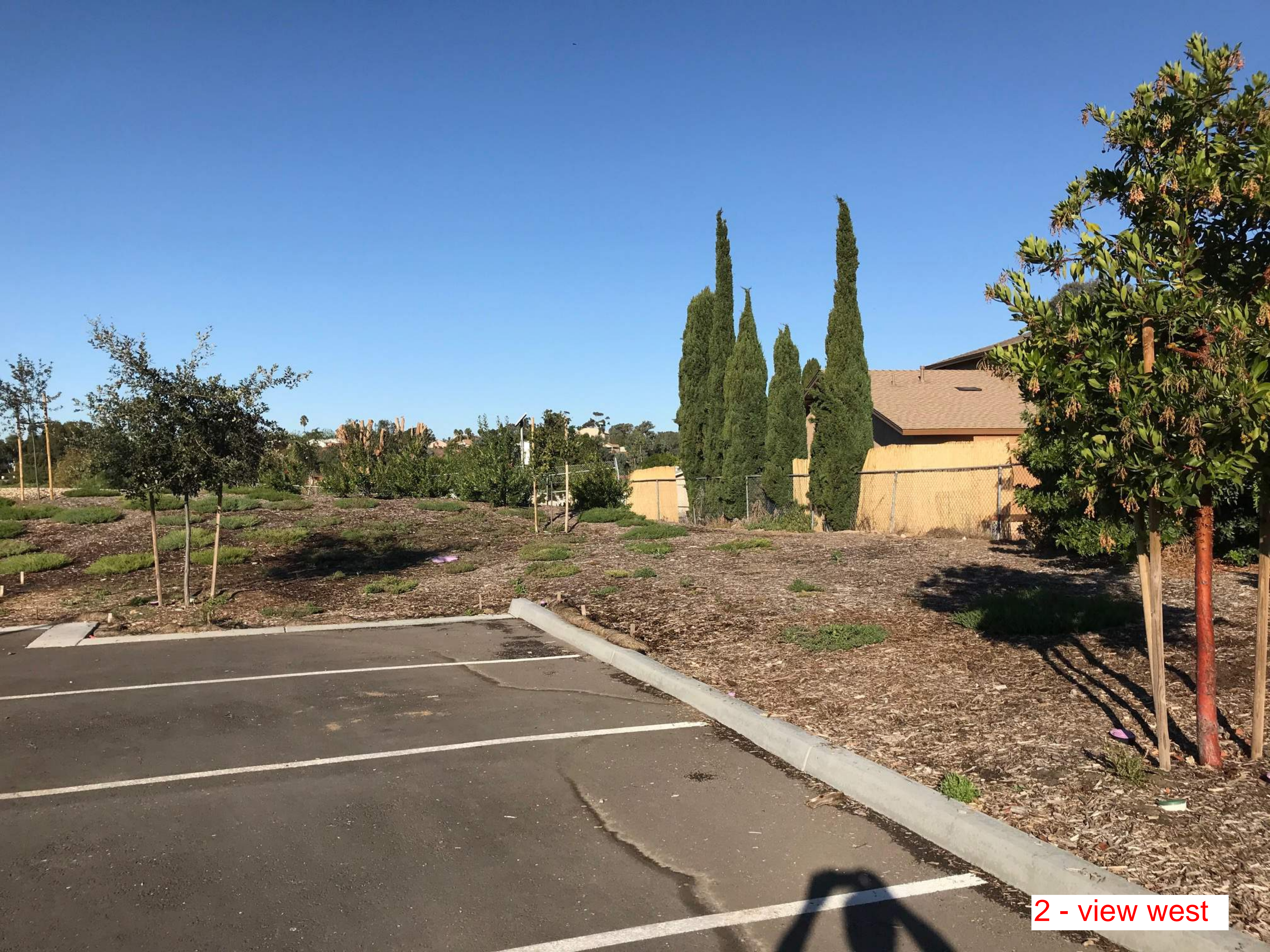
2 - view west