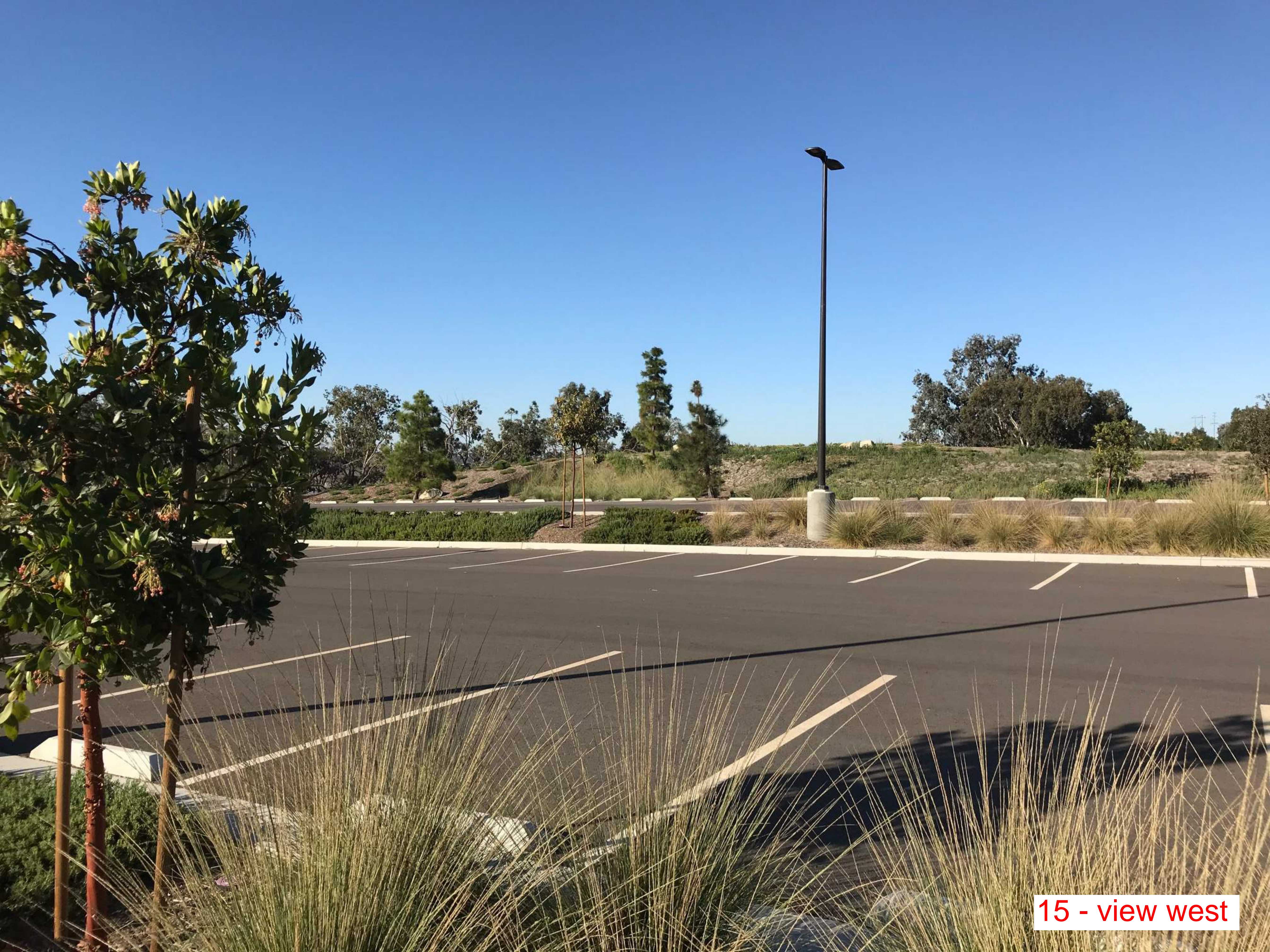
15 - view west