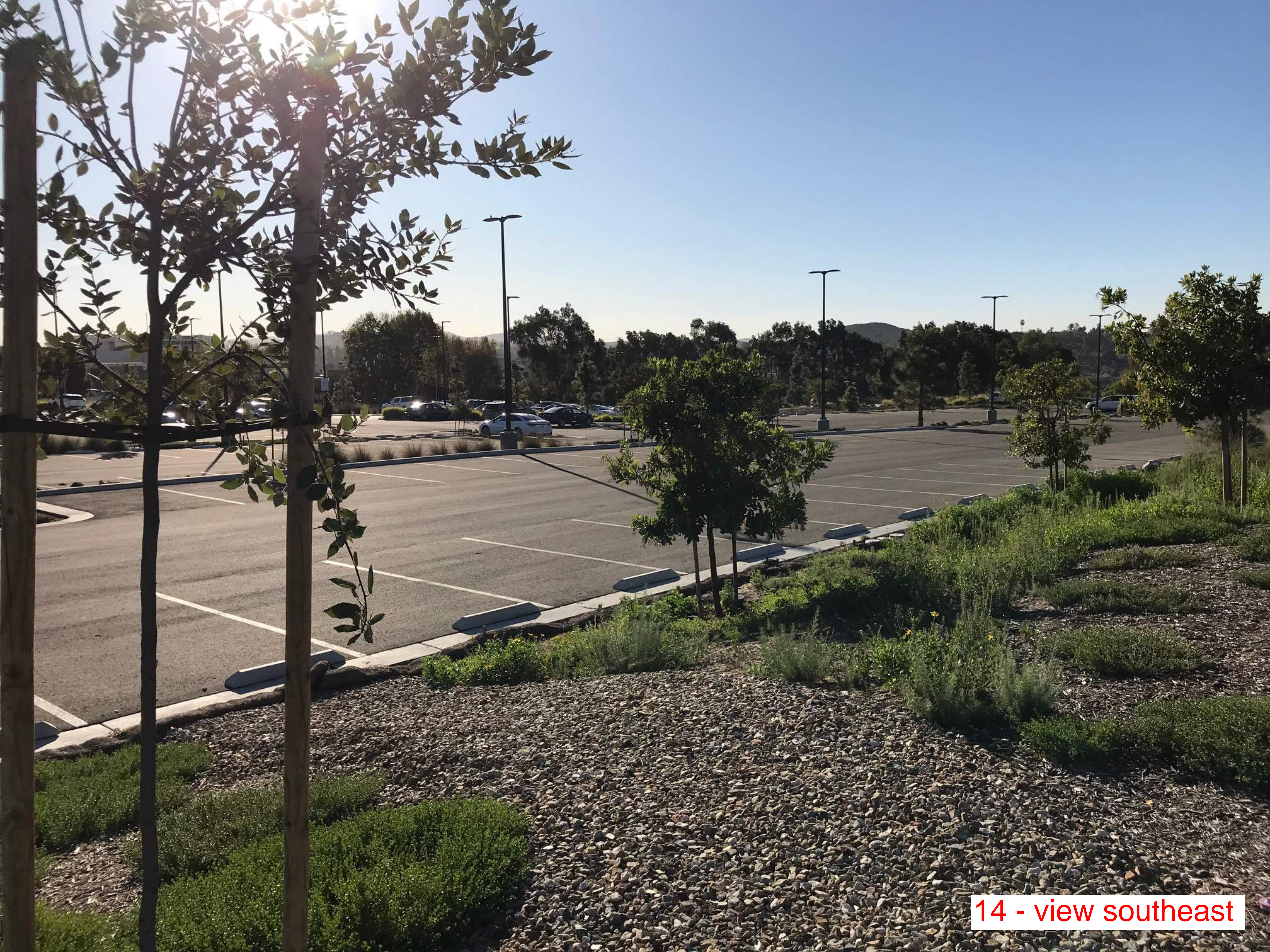
14 - view southeast