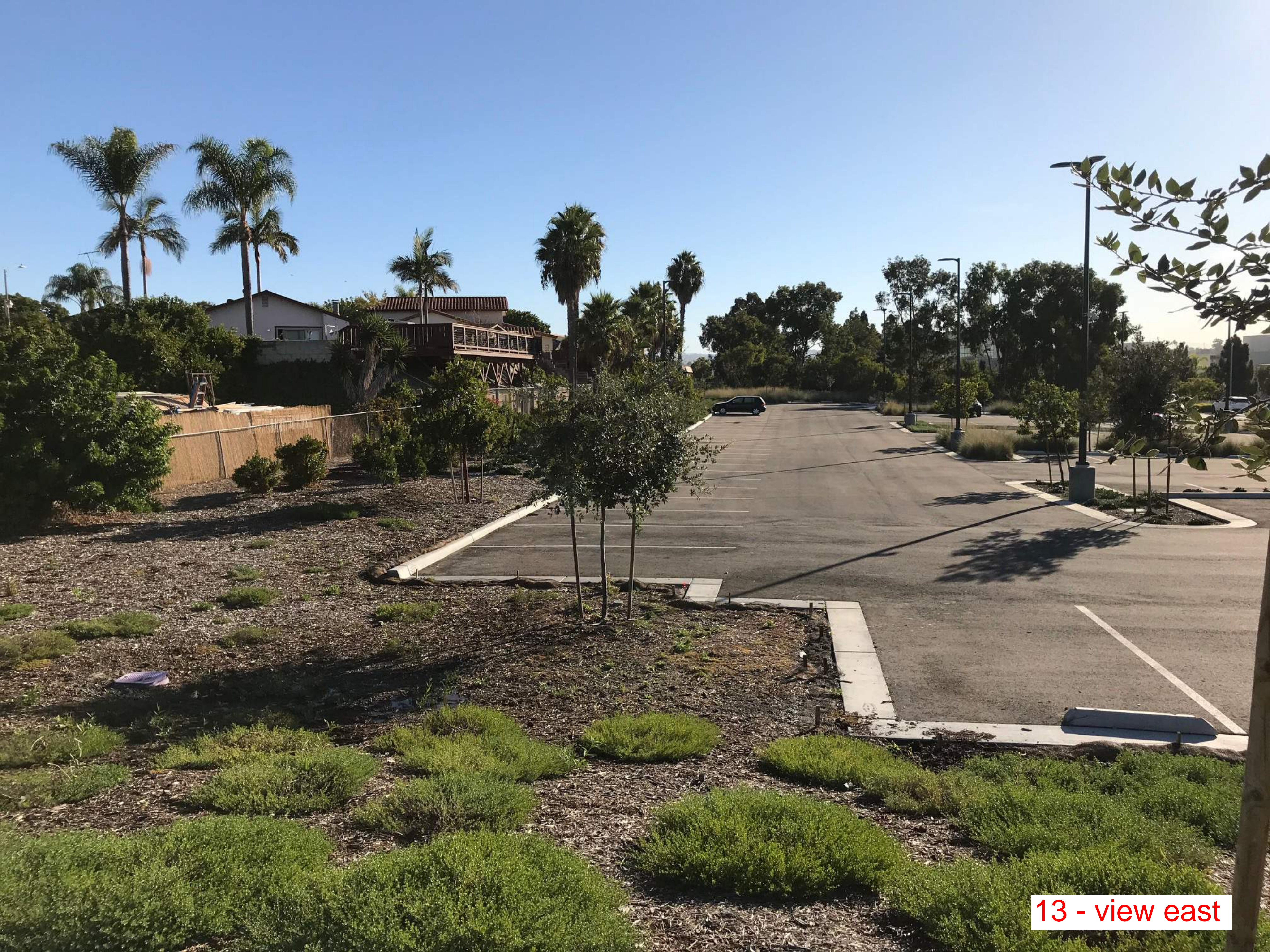
13 - view east