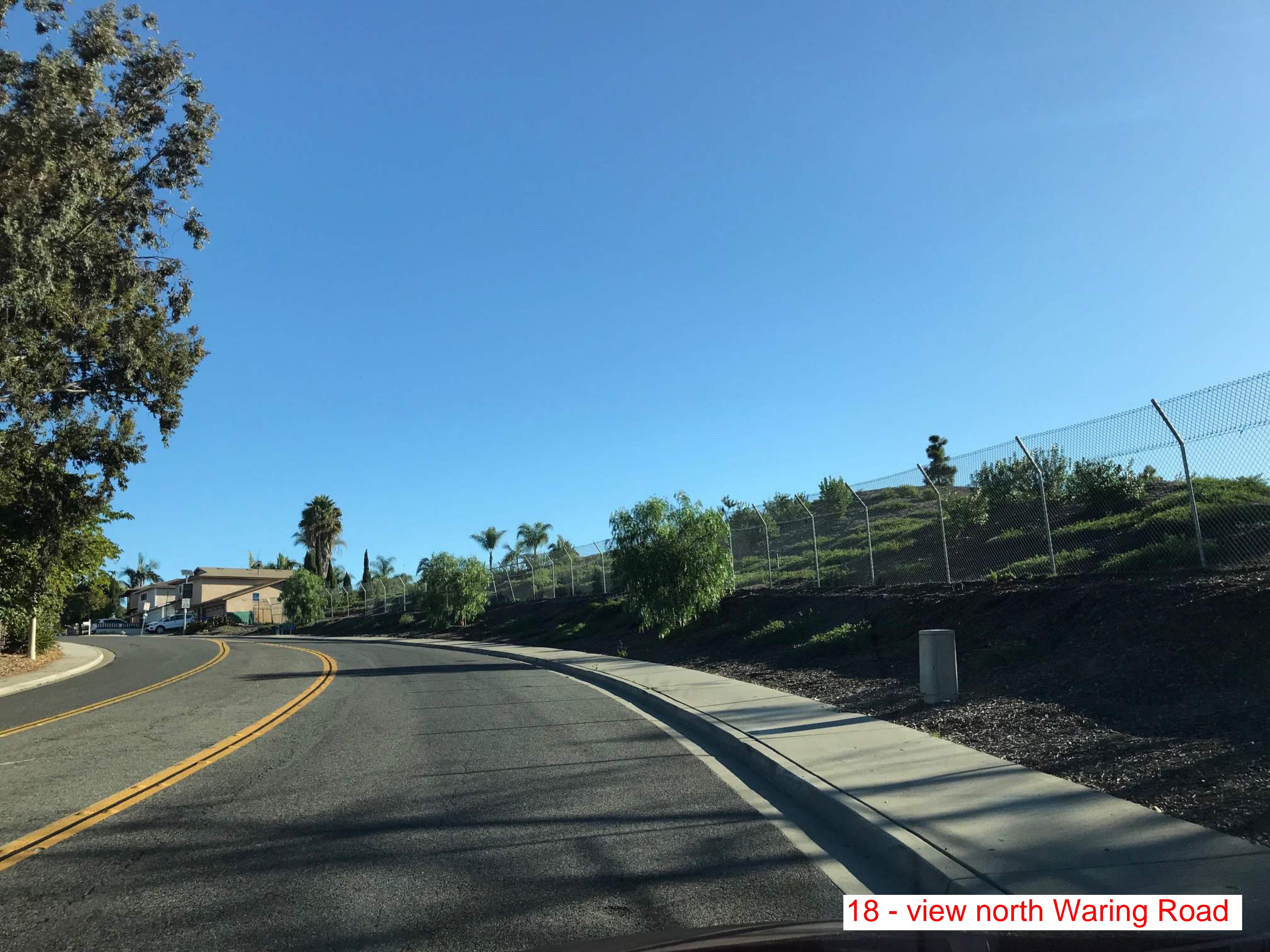
18 - view north Waring Road