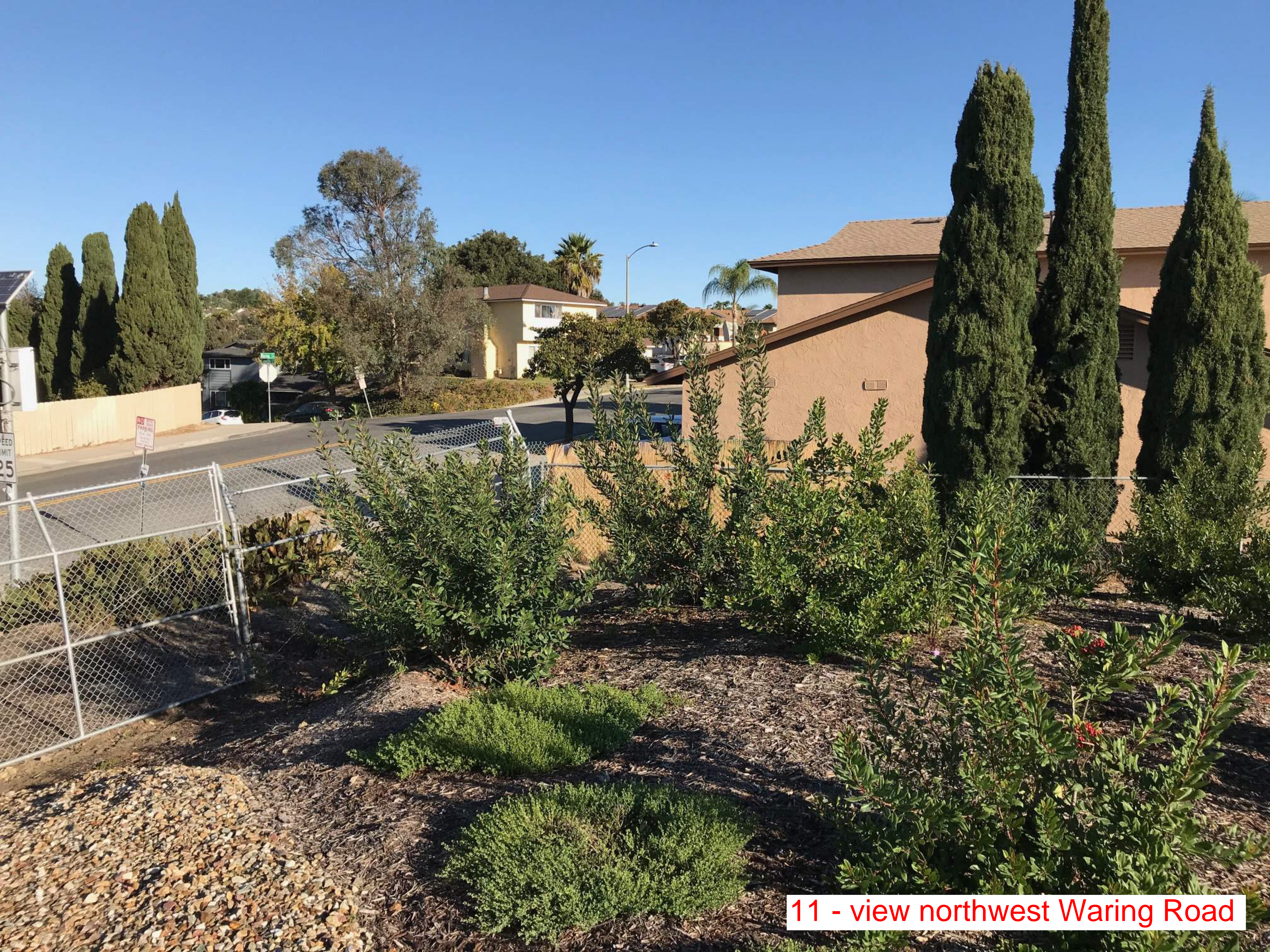
11 - view northwest Waring Road