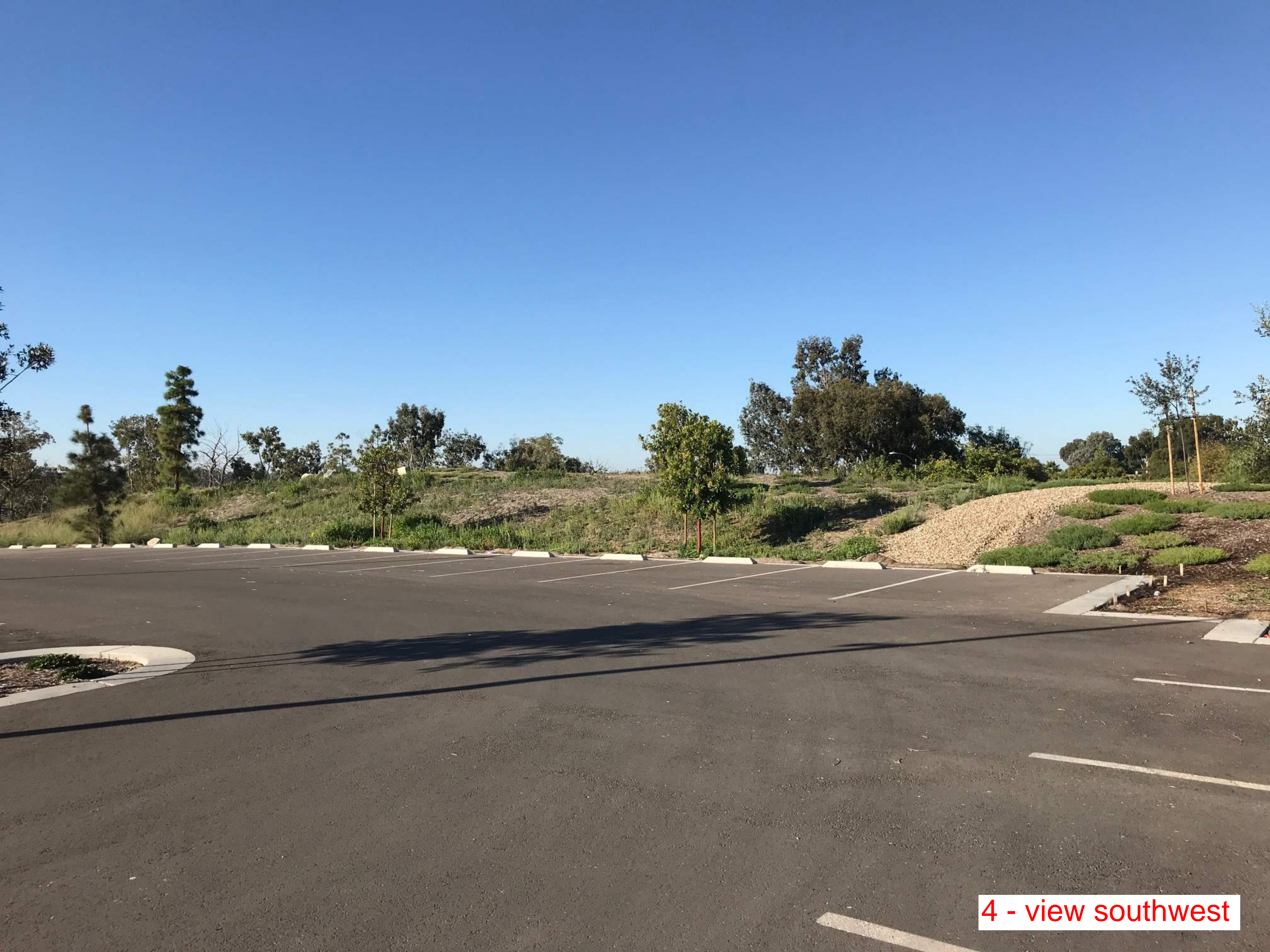
4 - view southwest