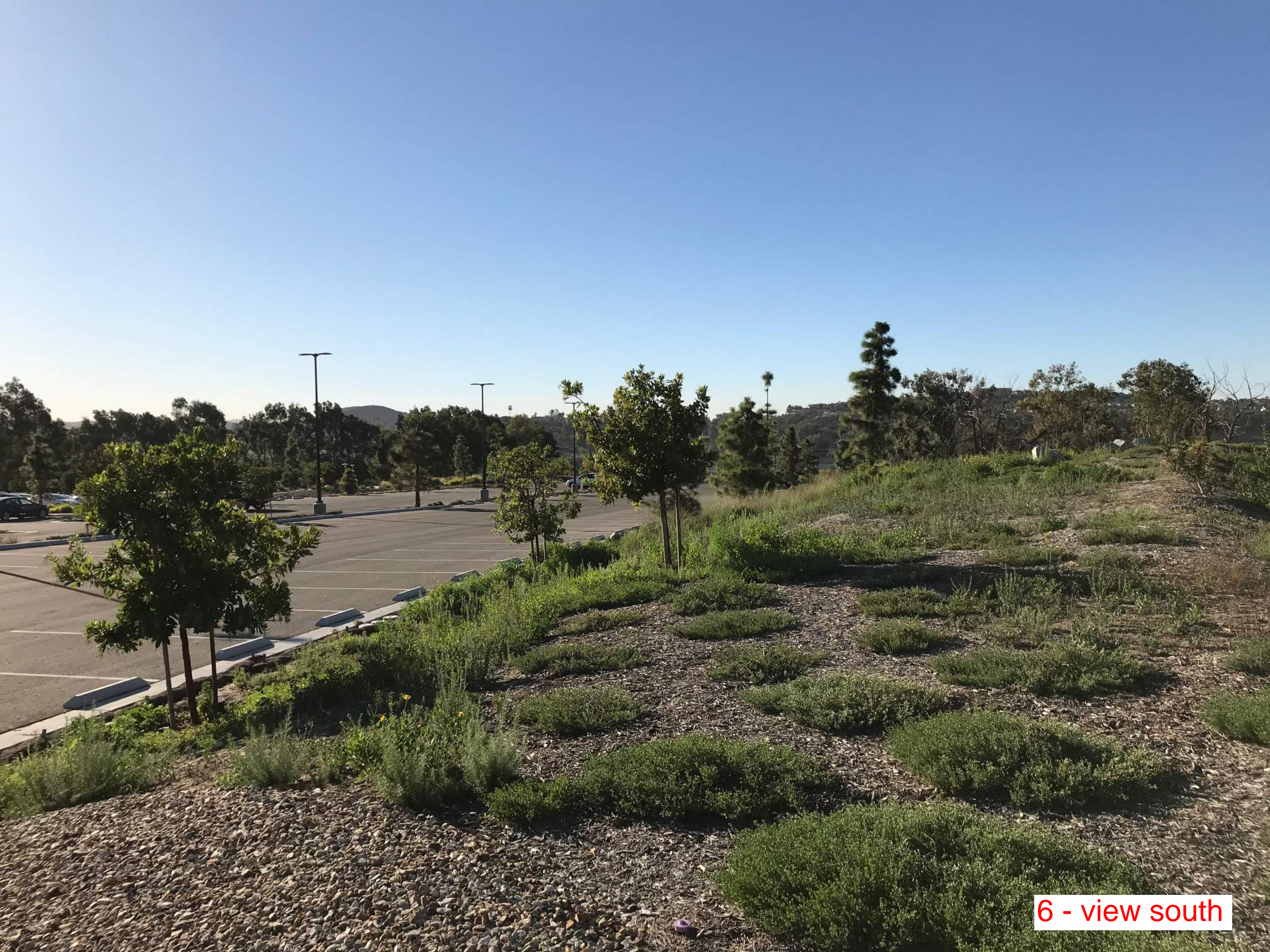
6 - view south