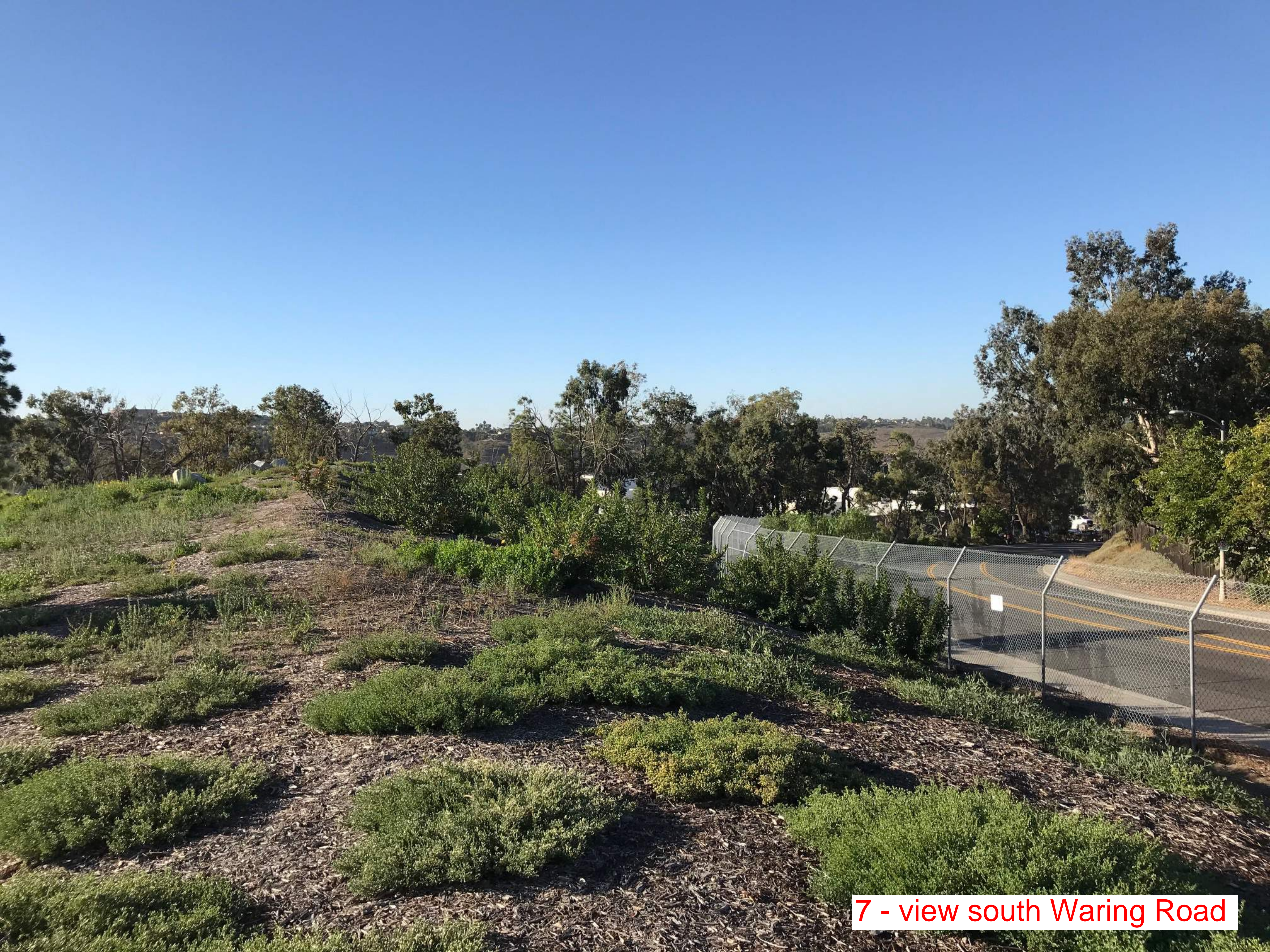
7 - view south Waring Road